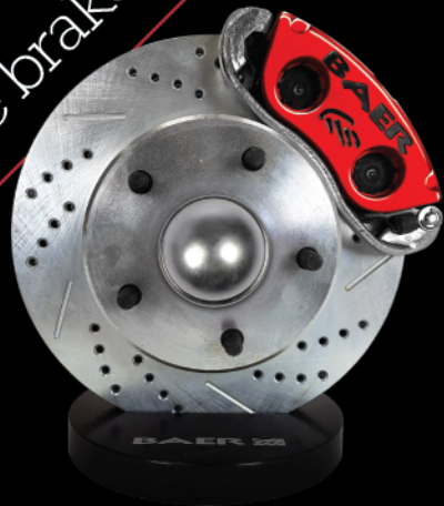
FRONT - Retail $695 11"

You have asked, and we have answered! Baer is bringing back the original Baer Claw Brake System that started it all, with the introduction of the Classic series. The Classic series is a direct bolt on for early GM, Ford and Mopar applications, features front and rear packages, red powder coated calipers, braided brake hoses, slotted and drilled rotors and best of all at affordable pricing! Want to modernize your early muscle car, still fit stock wheels, have access to replacement parts easily, not break the bank, and have the brand that is known for top quality products? Baer Classic is your answer!